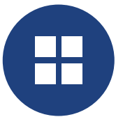
Microsoft Office 365