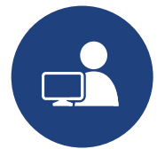
Strategic Consulting (VCIO)