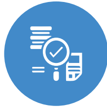
Governance and Compliance