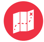
Implementation Roadmap & Remediation Projects