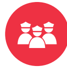
Physical Security Audits