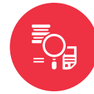
Policies & Procedures Review