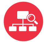
Monitoring and Alerting Systems Audits